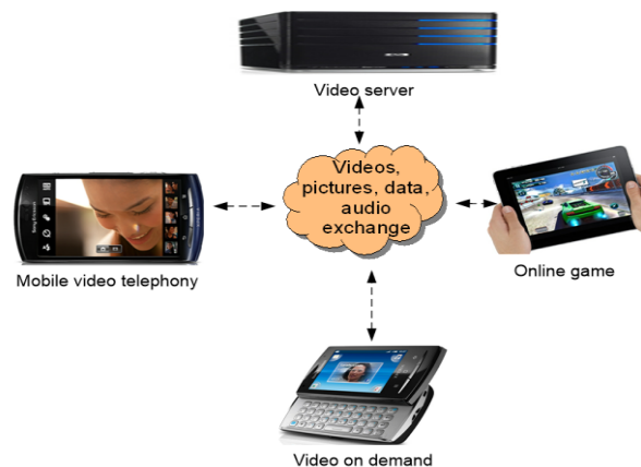
Figure 1: Typical wireless video networking system architecture.

exploitation of the media motion characteristics of the media streams in the video quality performance enhancement. One of the significant advantages of OFDMA system is the orthogonality characteristic among the subcarriers, which mitigates intra-cell interference. Another key benefit of OFDMA air interface is the frequency reuse capability, which mitigates inter-cell interference. Several advanced interference management schemes for fourth generation cellular standards are discussed in literature. Such interference management schemes include sectorisation, power control and regulated maximum transmit power level that can be applied to media streams. The details on these interference management techniques are discussed in [10, 11]. Assuming, a downlink transmission scenario where the effect of interference is negligible, the maximum base station transmit power becomes a significant parameter in determining the overall system performance. To reduce complexity, the proposed system considers a downlink scenario and assumes negligible interference. Figure 1, presents typical wireless video networking system architecture.